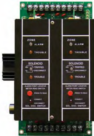
Solenoid monitor and release module with Class B initiating circuit. (Option F)

The RS-1 release module is UL listed and is approved by Factory Mutual for actuation of FM Solenoid Groups A, B, and D through K. The