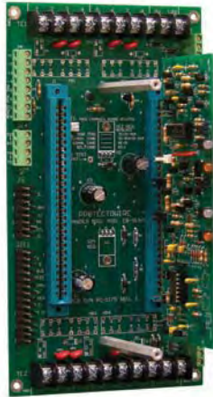
Zone expander board (EB-91A) with one plug-in zone module

The modular system design enables the system to be modified at any time. The required number of input and output circuits and system options are custom assembled and tested at the factory to ensure exact conformance with the customer's application requirements.