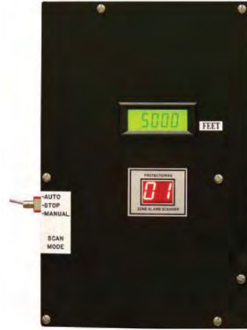
PDM-1000-2 Protectowire alarm point location meter with 16 zone alarm scanner. (Options A & C)

Protectowire introduces "smart" detector technology to Linear Heat Detectors. The PDM-1000-2 Meter (Option A) may be built into the 2000 Series Control Panel to locate a heat actuated point on the Protectowire Linear Heat Detector. The meter will display the distance in feet or meters from the start of the Detector portion of the zone to the overheated or actuated point on the Protectowire Linear Heat Detector.